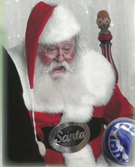
Visit with Santa & Mrs. Claus